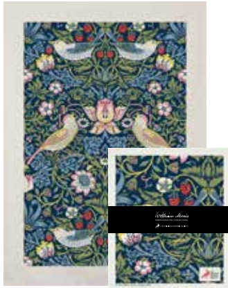
Strawberry Thief Blue Art. nr. WMGS5007

Kitchen towel 50x70 cm, 50% linen / 50 cotton Swedish dishcloth 172x200 mm, 70% cellulose / 30% cotton, 10-pack