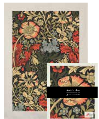
Compton Blue Art. nr. WMGS5012

Orders are made by email to info@citronelles.com or through our ÅF login website