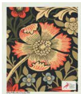
Compton Blue Art. nr. WMDC2012