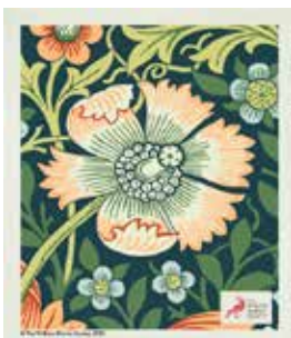
Compton Green Art. nr. WMDC2011