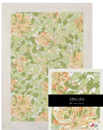
Honeysuckle Art. nr. WMGS5014