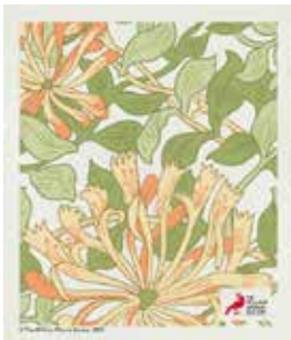
Honeysuckle Art. nr. WMDC2014