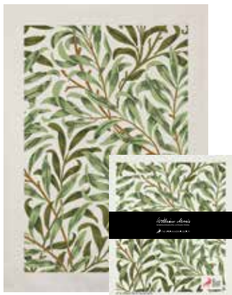
Willow Bough Art. nr. WMGS5010