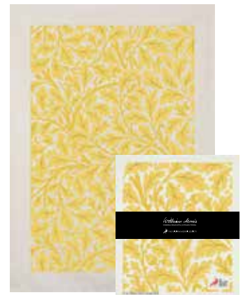
Oak Yellow Art. nr. WMGS5005