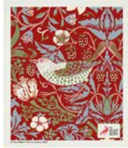
Strawberry Thief Red Art. nr. WMDC2020