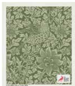
Bird and Anemone Art. nr. WMDC2004