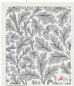
Oak Silver (with shimmer) Art. nr. WMDC2022