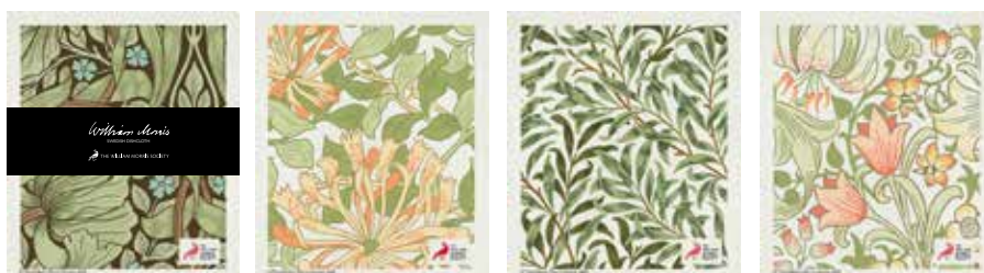
Pimpernel Green, Honeysuckle, Willow Bough, Golden Lily Green. Art. nr. WMDPMX44

Orders are made by email to info@citronelles.com or through our ÅF login website