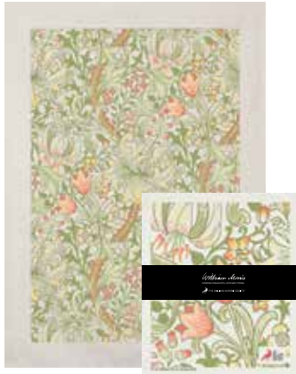
Golden Lily Green Art. nr. WMGS5017

Kitchen towel 50x70 cm, 50% linen / 50 cotton Swedish dishcloth 172x200 mm, 70% cellulose / 30% cotton, 10-pack