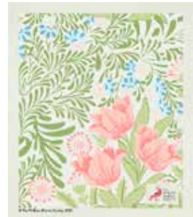
Bower Art. nr. WMDC2018