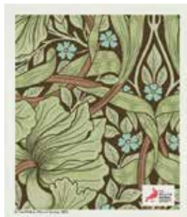
Pimpernel Green Art. nr. WMDC2015