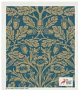
Acorn Gold (with shimmer) Art. nr. WMDC2019

70% cellulose / 30% cotton, 172x200 mm, 10-pack