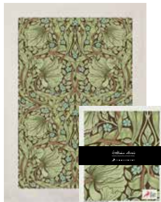
Pimpernel Green Art. nr. WMGS5015