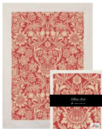
Sunflower Red Art. nr. WMGS5013