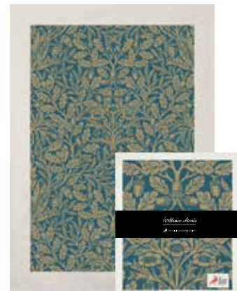
Acorn Gold (with shimmer) Art. nr. WMGS5019