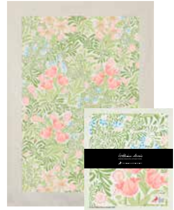
Bower Art. nr. WMGS5018