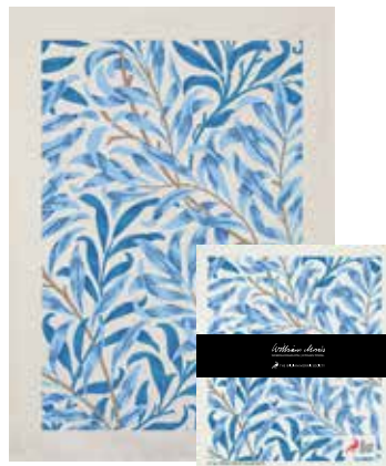
Willow Bough Blue Art. nr. WMGS5023