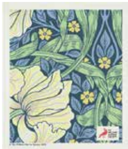
Pimpernel Meadow Art. nr. WMDC2016