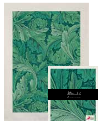
Acanthus Art. nr. WMGS5001

Orders are made by email to info@citronelles.com or through our ÅF login website