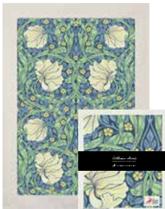
Pimpernel Meadow Art. nr. WMGS5016