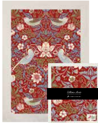
Strawberry Thief Red Art. nr. WMGS5020