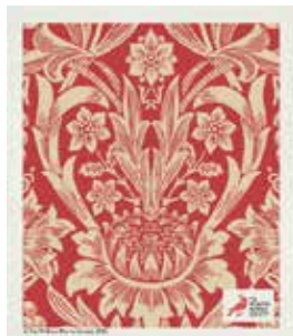
Sunflower Red Art. nr. WMDC2013