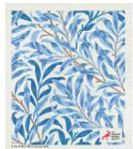
Willow Bough Blue Art. nr. WMDC2023