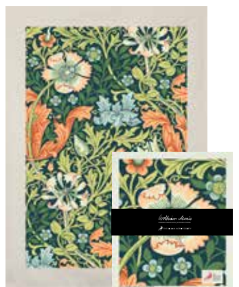
Compton Green Art. nr. WMGS5011