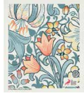
Golden Lily Blue Art. nr. WMDC2021