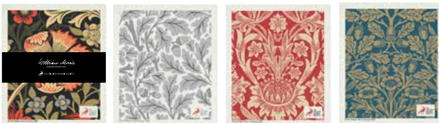
Compton Blue, Oak Silver, Sunflower Red, Acorn Gold. Art. nr. WMDPMX43