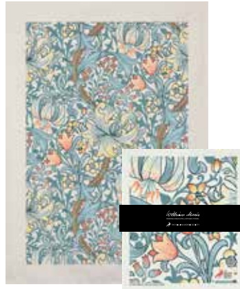
Golden Lily Blue Art. nr. WMGS5021