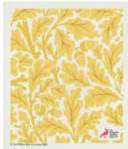
Oak Yellow Art. nr. WMDC2005