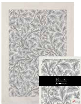
Oak Silver (with shimmer) Art. nr. WMGS5022