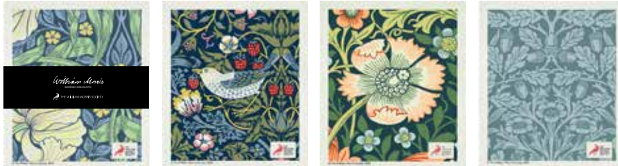
Pimpernel Meadow, Strawberry Thief Blue, Compton Green, Acorn Blue. Art. nr. WMDPMX41