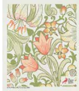
Golden Lily Green Art. nr. WMDC2017