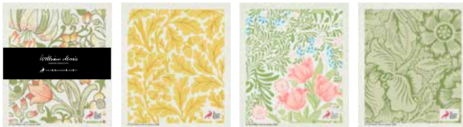
Golden Lily Green, Oak, Bower, Pink and Poppy. Art. nr. WMDPMX42