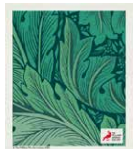
Acanthus Art. nr. WMDC2001

Orders are made by email to info@citronelles.com or through our ÅF login website