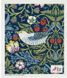
Strawberry Thief Blue Art. nr. WMDC2007

70% cellulose / 30% cotton, 172x200 mm, 10-pack