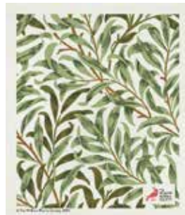
Willow Bough Green Art. nr. WMDC2010