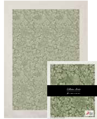
Bird and Anemone Art. nr. WMGS5004