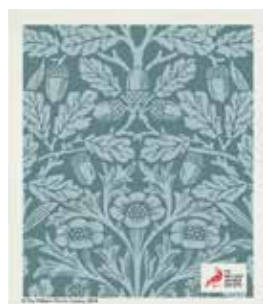
Acorn Blue Art. nr. WMDC2002