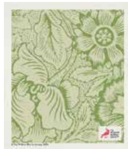
Pink and Poppy Art. nr. WMDC2006